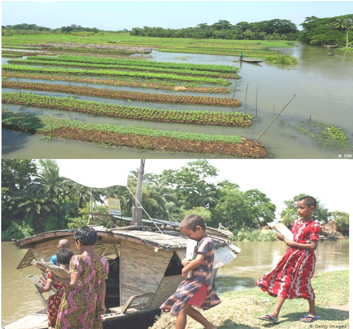
Figure 1. Boat School, Floating Farms: Bangladesh Builds Floating Gardens to fight against Climate Change