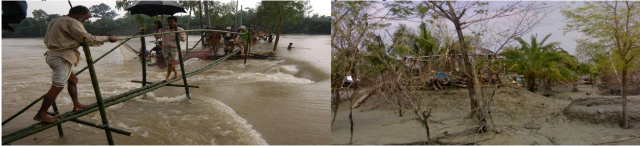
Figure 3. Examples of riverine activities which may cause pollution

Sometimes illegal, unreported, and unregulated (IUU) fishing causes marine pollution. The waste of all the industries particularly tannery, textiles, pulp and paper and fertilizer, ship breaking, and so on may be significantly responsible for coastal pollution of Bangladesh. ix Bangladesh National Programme of Action has identified fifteen x major issues/problems as the main sources of coastal and marine pollution. The issues are as follows: